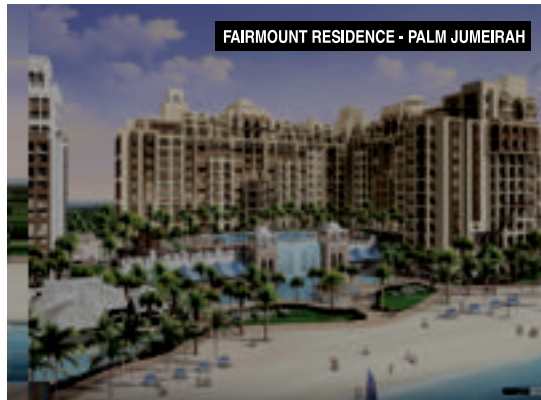
FAIRMOUNT RESIDENCE - PALM JUMEIRAH