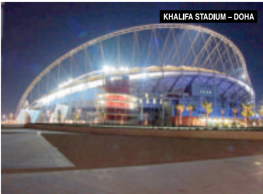
KHALIFA STADIUM – DOHA