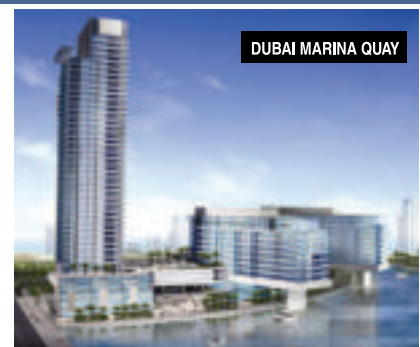
DUBAI MARINA QUAY