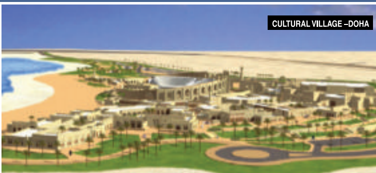
CULTURAL VILLAGE – DOHA