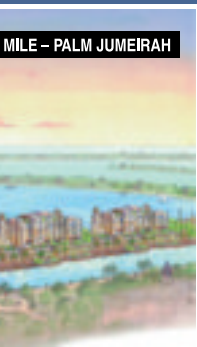
MILE – PALM JUMEIRAH